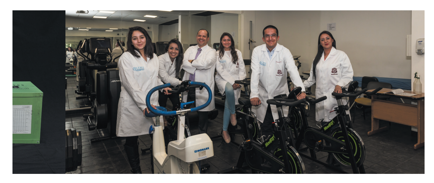
The group focuses on physical activity and explores its beneficial effects in other areas such as physical condition, thought processes. self-esteem, and other aspects of physical and mental health.