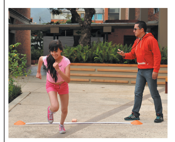
Through its research, the University promotes physical activity that brings multiple benefits for health.