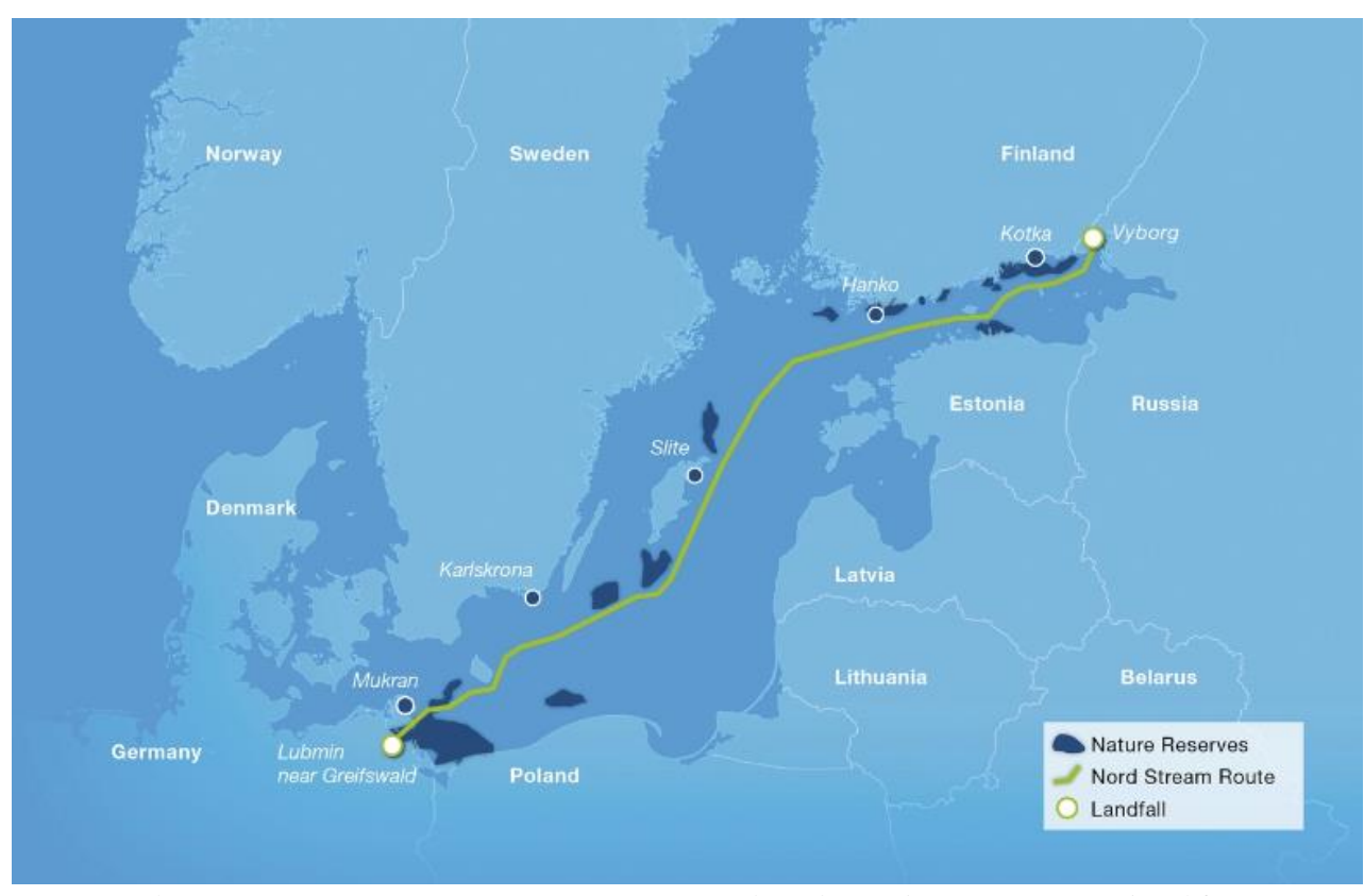
Annex 1. Map 1. Nord stream pipeline