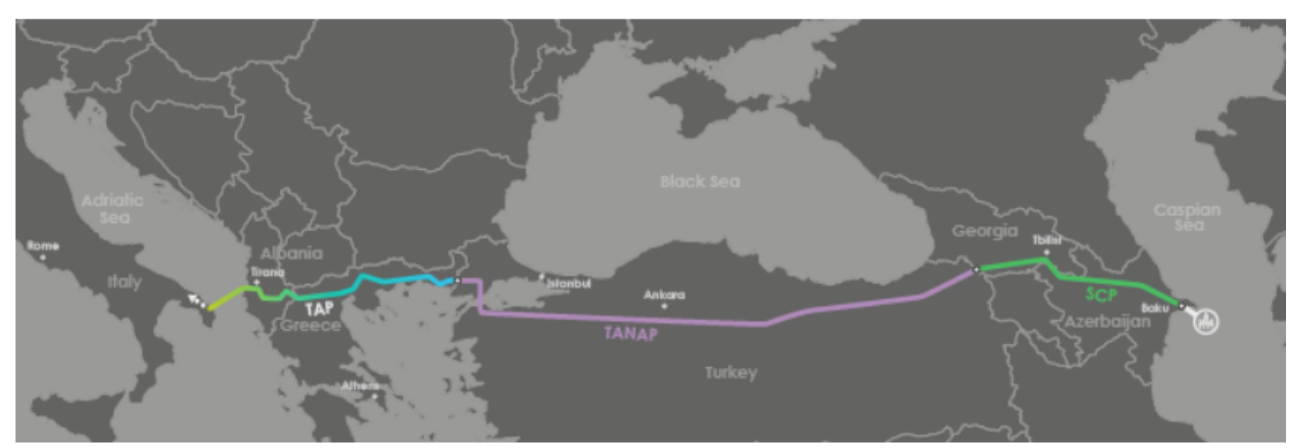
Annex2. Map 2. South Stream Corridor