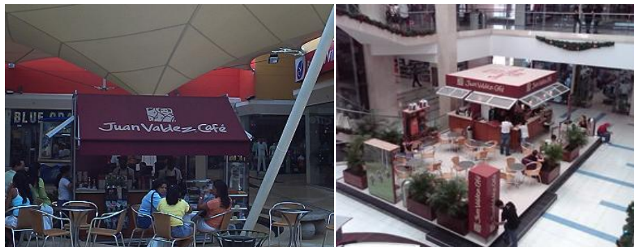
Ilustración 2: Juan Valdez Distribution Channel

Juan Valdez flag-Ship distribution channel operates under the same concept of Brasseries.