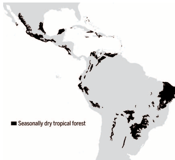
Fig. 1. Schematic dry forest distribution in the Neotropics. [Based on Pennington et al. (13), Linares-Palomino et al. (2), Olson et al. (45), and the location of DRYFLOR inventory sites (see Fig. 2)]

We evaluate the floristic relationships of the disjunct areas of neotropical dry forest and highlight those that contain the highest diversity and endemism of woody plant species. We also explore woody plant species turnover across geographic space among dry forests. Our results provide a framework to allow the conservation significance of each separate major region of dry forest to be assessed at a continental scale. Our analyses are based on a subset of a data set of 1602 inventories made in dry forest and related semi-deciduous forests from Mexico and the Caribbean to Argentina and Paraguay that covers 6958 woody species, which has been com-