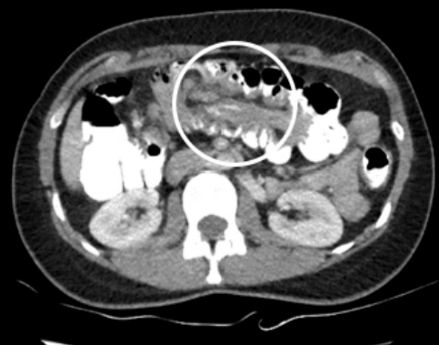
Figure 1. CT scan of the abdomen performed on admission showing colo-colonic intussusception.