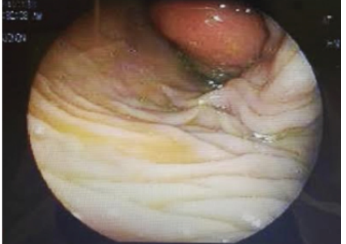
Figure 2. Preoperative colonoscopy showing submucosal lesion in the proximal transverse colon.

Subsequently, because of the impossibility of endoscopic management due to the size of the lesion, the patient was taken to surgery, where a right hemicolectomy was performed by laparoscopy with side-to-side extracorporeal anastomosis with mechanical suture, without using drains. Mechanical bowel preparation was not considered necessary for this procedure; however, prior to surgery, prophylactic antibiotics (first-generation cephalosporin) were administered.