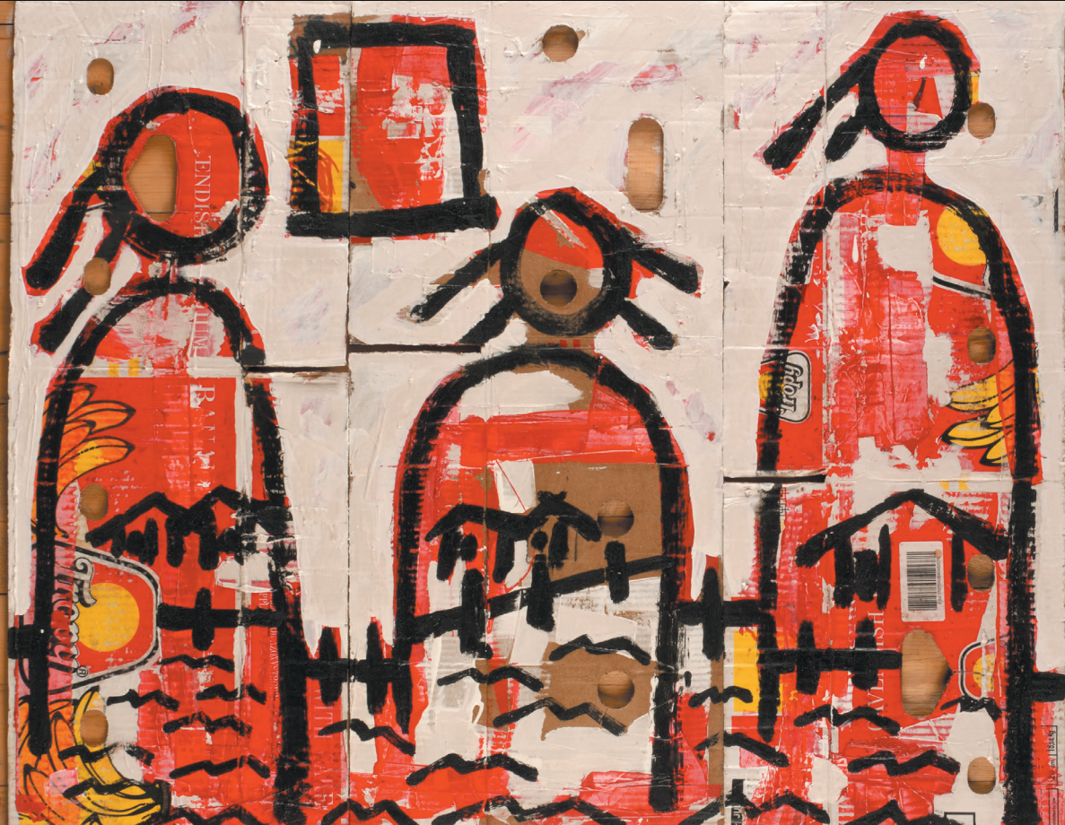
← The children recruited by subversive groups may now be around 15-years-old or close to reaching adulthood.

opted the optional protocol of the Convention on the Rights of the Child, which seeks to increase the minimum age for membership in the armed forces.