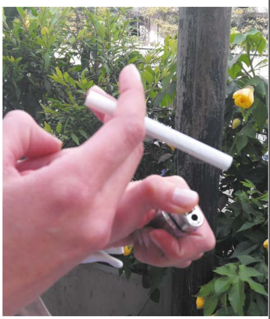
Experience shows that the most economically effective way to reduce the consumption of tobacco is to increase its cost by imposing taxes.

The general objective of this research is to better understand the impact of prices and packaging on cigarette consumption and on health equity in middle-income countries. The idea is to generate information about how higher taxes on tobacco translate into changed behavior on the part of vulnerable populations, taking into account the regulatory context.